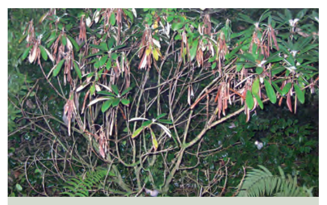
PHYTOPHTHORA KERNOVIAE on Rhododendron 'Ding Dong' – a Trengwainton hybrid

One of the major hosts of the disease was found to be Rhododendron ponticum , its huge biomass providing a host for large inoculum levels. As with other gardens in Cornwall, we are removing R. ponticum where possible within the garden as well as from the immediate