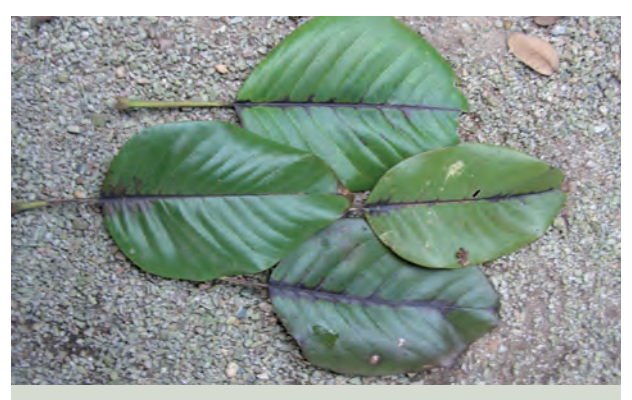
MAGNOLIA DELAVAYI infected with Phytophthora kernoviae IAN WRIGHT

surrounding area, in order to lessen the risk to our more valuable specimens. This brings additional problems however, as a lot of the older ponticums were planted for shelter and indeed, like other collections, ours includes a lot of ponticum hybrids.