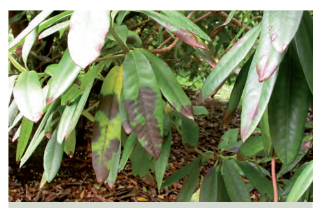
PHYTOPHTHORA RAMORUM on Rhododendron 'Loderi King George'

kernoviae have now given us additional cause for concern. (Found while surveying for P. ramorum , P. kernoviae is, at the moment, predominantly Cornwall-based, as its name suggests [Kernow being the Cornish word for Cornwall]. However, scientists regard it as a more aggressive strain.)