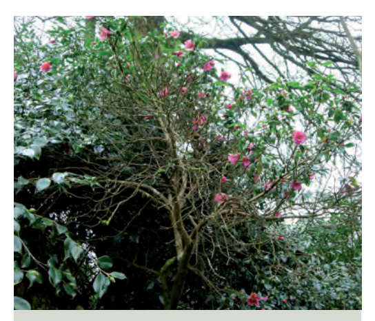
PHYTOPHTHORA RAMORUM causing defoliation on Camellia x williamsii 'Donation'

The Central Science Laboratory (CSL, York) and Forest Research (Alice Holt Lodge, Surrey) are currently undertaking various research projects to understand the disease, and a gradual picture of the cycle of the pathogen is emerging.