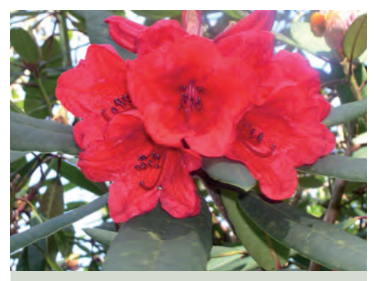
RHODODENDRON 'Morvah' at Trengwainton