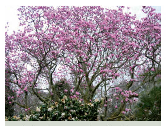
MAGNOLIA CAMPBELLII, planted in 1926 at Trengwainton and as yet uninfected

During the last 6 years, as the current Head Gardener at Trengwainton, I have had many concerns about factors affecting our ageing plant collection. Honey Fungus ( Armillaria spp.) in particular causes endless heartache as a result of the annual losses it causes. Phytophthora ramorum and the more recently discovered Phytophthora