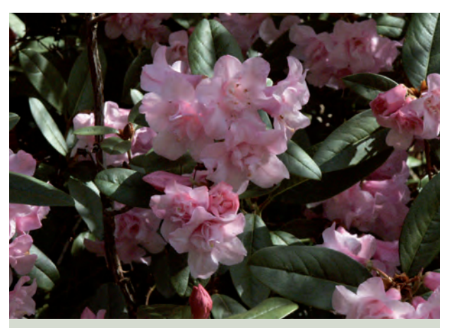
RHODODENDRON 'Johnnie Johnston' at Trengwainton PAM HAYWARD

At Trengwainton, we found we needed a more comprehensive set of records than we had assumed were in place, with large areas of our collection being left out of the Woody Plant Catalogue system we had been using. The Catalogue was very out of date, the situation being accentuated by the quick turnover of plants in this area of the country. We needed a better picture of what we were looking after and growing in our garden.